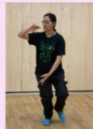
Beijing 24 Step