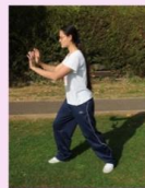
T'ai Chi Health